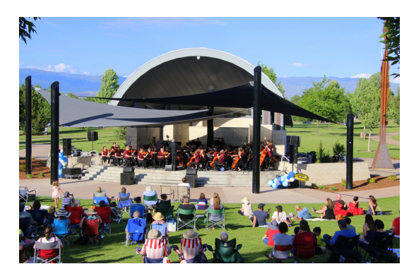
Every other Friday June 7-August 16