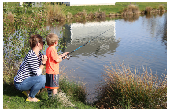
Saturday, May 11-18